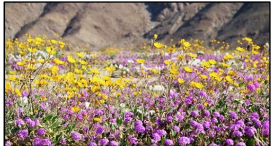
Henderson Canyon

Hear weekly recorded wildflower reports at the Voice of the Wild Flower Hotline, at (818) 768-1802 ext. 7 . New reports are released every Friday, March through June! All locations are on easily accessible public lands and range from urban to wild, distant to nearby.