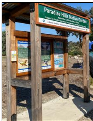
Interpretive kiosk (left) and Ethnobotany kiosk 2023 (below).

The garden is most precisely five closely related constituent gardens, each with a different emphasis, one being a Kumeyaay Ethnobotany Garden. Kiosks with interpretive sign panels are located in separate areas and metal plant signs list sizes, water requirements, dormancies, pollinators hosted, etc. Signage in the ethnobotany garden explains how the area's first peoples used plants for food, medicine, tools, fuel, and materials.