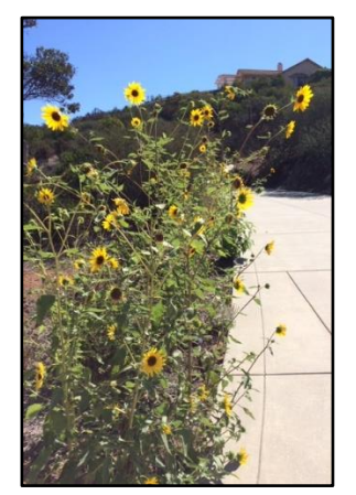
Above: Common sunflower ( Helianthus annuus ) growing along Sue's driveway.

Later that summer we were rewarded with very tall, prolific flowering plants. They were watered close to the ground only