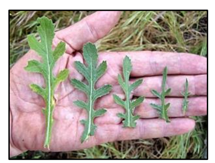
Leaves