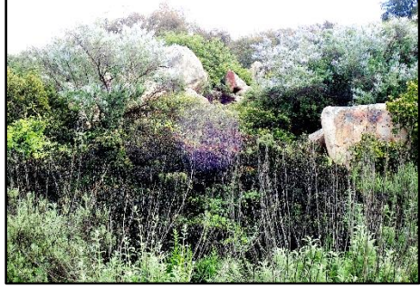
Barnett Ranch.