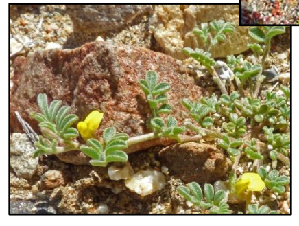
and Purple Mat ( Nama demissum, below) were mainly represented by diminutive specimens;

and Hairy Lotus ( Acmispon strigosus , below), and even