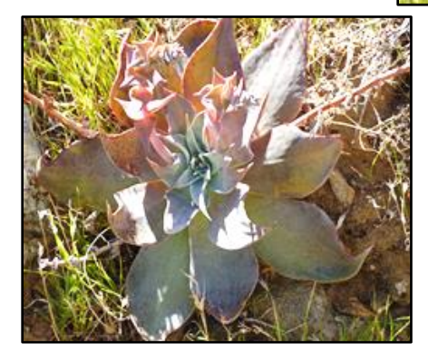
On our way back to the car we admired spectacular Arizona Dudleya ( Dudleya arizonica )

and the beautiful pattern on Agave stalks -