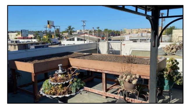
Photos: Before (above) and after(below) planting California native plant species.

school diplomas while gaining valuable work experience. Urban Corps, as a dual work-learn program for disconnected young adults, promotes the mission of CNPS throughout the County on environmental conservation projects, including the removal of nonnative plants and revegetation with native plants. This project will specifically promote the mission through furthering the Corpsmembers' work with native plants from conservation to education and how to care for native plants. All the species planted will be labeled so the Corpsmembers can learn the names so they can communicate in the field about which species they are seeing and planting, and which not to remove.