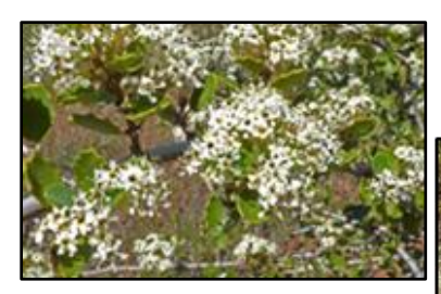
Ceanothus ( Ceanothus perplexans ), those of Shelter Valley with Goldfields ( Lasthenia sp., right).

This walk took us to Rainbow Canyon in the Anza-Borrego Desert. The drive from Santa Ysabel via Julian and the Banner Grade already had flowering shrubs (white and blue Ceanothus as well as Bush Poppy and Brittlebush), but the real show began in the desert with Fiddlenecks and Lupines along county road S2.