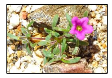
Chia ( Salvia columbariae ) flowers are of course always tiny (right).