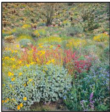
Left: Wildflowers in Anza-Borrego Desert State Park. Below: Phacelia and Mimulus species in the desert.