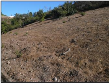
Below: Hillside in September 2009, fresh after weed whipping.

I got tired of looking at this eyesore hillside, so about a decade ago, I killed the grass with a post-emergent herbicide (Clethodim) and stopped the yearly weed-whipping. Shrubs that had hung in through 25 years of mistreatment, with long-established roots, now