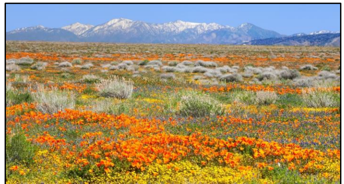
California wildflowers.