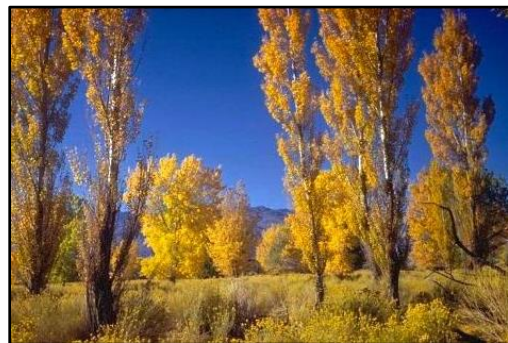
Black cottonwood ( Populus trichocarpa ).

Planting Natives: Fall is definitely in the air with Thanksgiving Day just around the corner! Many of you are probably busy planting your new natives from the recent CNPS-SD Native Plant Sale. If you missed the sale, remember you can order natives through Moosa Creek Nursery under "Retail Customers" in the tab bar. CNPS members receive a 10% discount by entering "CNPS" in the promo code box at checkout. Payment will be collected when you pick up your order at the partner nursery you designate. Other local (Garden Committee – Continued on p. 2)