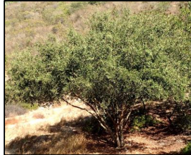
This scrub oak ( Quercus berberidifolia : left) was 3 feet tall in 2009 and is now 19 feet tall and 27 feet wide, a growth rate of 1.3 feet/year. Most of the scrub oaks on this hill grow more slowly, but they still grow rapidly enough to

I trim the shrubs on the hillside into tree form by pruning the limbs closest to the ground. This not only makes the plants look better, but also makes it easier to maintain the ground under the shrubs, improving fire safety. Pruning branches at the bottom also spurs the plants to add growth at the top. I have been surprised at how quickly these shrubs have grown. In the next 10 years, I expect many to become 20- to 30-foot tall trees.