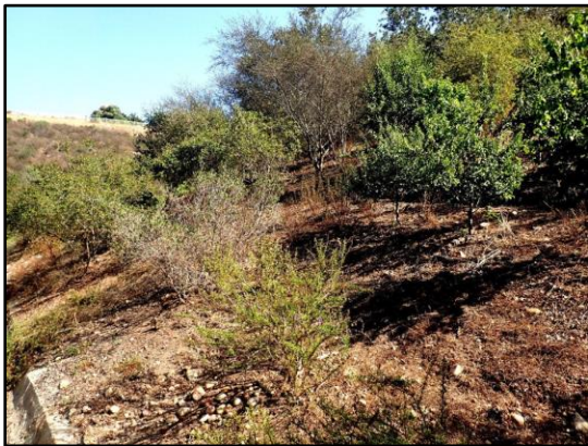
The view in September 2020 from the same place as the 2009 photo. Shrubs in this photo include woolly blue curls ( Trichostema lanatum ), mission manzanita ( Xylococcus bicolor ), holly-leaf cherry ( Prunus ilicifolia ), scrub oak ( Quercus dumosa and Q. berberidifolia ), and Ramona lilac ( Ceanothus tomentosus ).

grew quickly. Since large areas remained open, I started planting native shrubs in the gaps. To find native plants I liked, I walked around natural open spaces in the surrounding neighborhoods. I also began to irrigate the area monthly, each time depositing around 1 inch of water. This work of planting and irrigating has transformed the hillside in 10 “short” years.