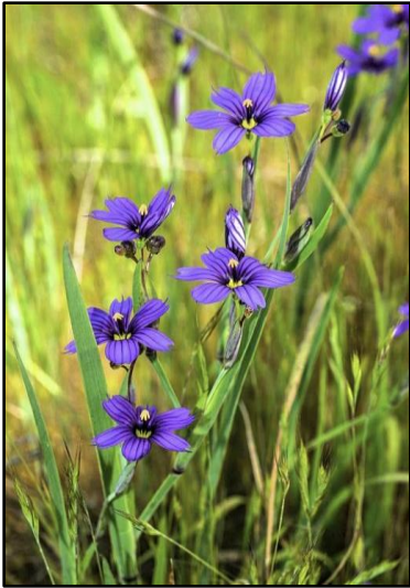
Blue-eyed grass ( Sisyrinchium bellum ).

An easy-to-grow perennial to consider is blue-eyed grass ( Sisyrinchium bellum ), which occurs in California in meadows,