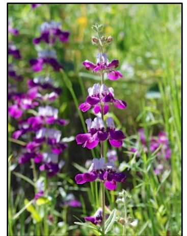
Purple Chinese houses ( Collinsia heterophylla ).

Did you by chance sow any annual native flower seeds this fall, and were any of them purple Chinese houses ( Collinsia heterophylla )? You still have time here in our area. It is recommended to sow purple Chinese house seeds in late fall directly on the surface of finely raked, medium-to-rich, moist soil. Space seeds 12-18 inches apart and expect germination within 10-30 days. You can also start seeds in peat pots in a sunny area and transplant them when they are 6 inches tall.