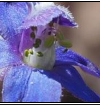
What a treat this was! Intermediate larkspur, aka oceanblue larkspur, ( Delphinium parishii ssp. subglossum ); note the green anthers (left), and the fruit (below).