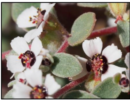
Red-gland spurge (Euphorbia melanadenia).