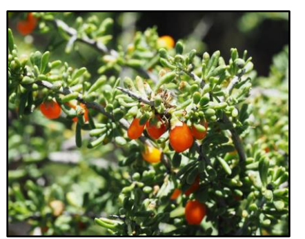
(Above) Anderson thornbush (Lycium andersonii) in fruit.