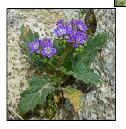
Heliotrope phacelia ( Phacelia crenulata var. ambigua )