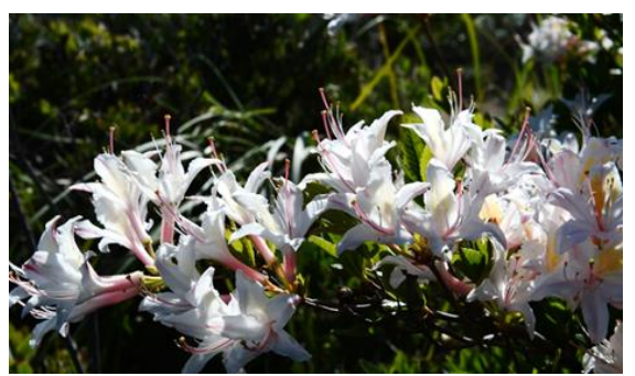
Rhododendron occidentale (Western azalea).

Walking down a steep stretch that turned to a more gradual downhill, I saw one growing next to the trail. It was an individual plant with less than vigorous growth that had some dry appearance. It was near mile marker 4. The trail went on farther into an area that seemed to have greater moisture. A small rivulet crossed the trail. I looked around and saw a moist habitat that was unfortunately invaded by Cortaderia selloana (pampas grass). On the southside bank of the small creek grew a nice series of good-sized Huckleberry shrubs. I stopped and was looking around when I noticed a shrub that had some partially past 3-inch long flowers that looked like semi wilted trumpets. I looked again and realized that they were azaleas, wild azaleas! I know I blurted it out and then saw some more in good flower with intact fresh petals. Looking around some more, I found other medium sized shrubs with the white azalea flowers. I suppose I remembered somewhere in my mind that they grew here, but I was certainly surprised to see them. I don't know if the people in our little group even understood what I was talking about.