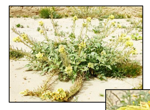
Peirson's clavate fruited primrose ( Chylisma claviformis ssp. peirsonii ), somewhat past its prime.