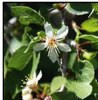
Desert apricot ( Prunus fremontii ) seen at the Plum Canyon field trip in 2013.

If you want to caravan or ride-share from the San Diego coastal area, meet 7:45 AM at the Park'n'Ride by Sabre Springs Road, just north of Poway Road (Thomas Guide 1189 H-6). From I-15, take Poway Road east, turn left on Sabre Springs Road, then first left into the shopping center driveway. Then, turn into the right-hand parking lot the bottom of the driveway.