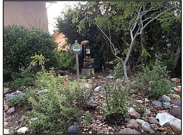
(top) Judie & Jeff Lincer’s garden.