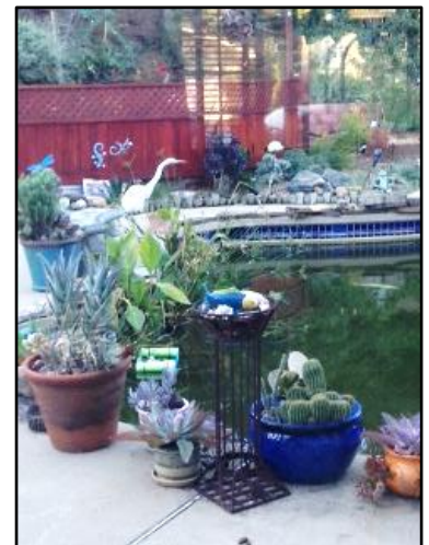
(left) Their pool turned pond. See their whole garden and this adaptation on this year’s native garden tour.