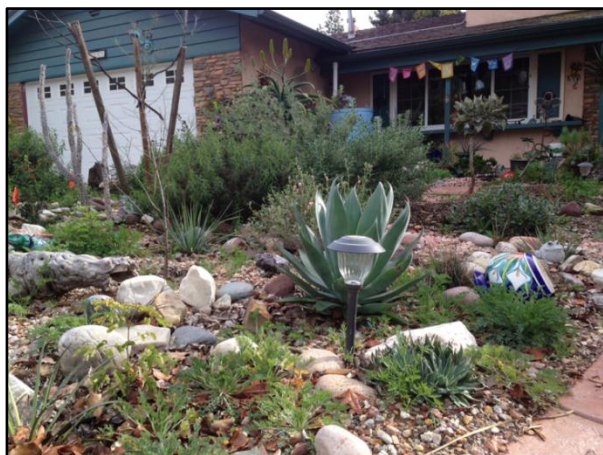
Judie and Jeff Lincer’s front garden.