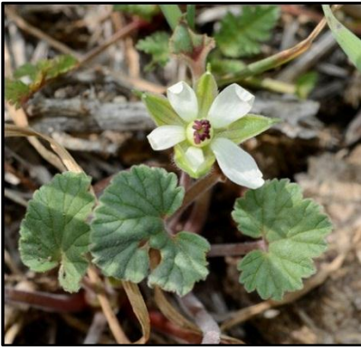
Round-leaved filaree ( California macrophylla ).