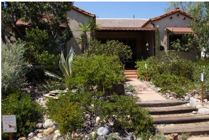
Connie and Pete di Girolamo's native plant garden.