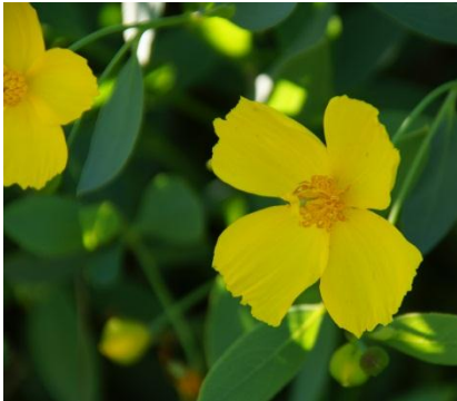
Bush poppy ( Dendromecon rigida )