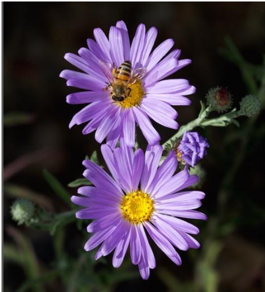
Mt. Laguna Aster ( Dieteria asteroides var. lagunensis) flowering along Sunrise Hwy in August 2015.