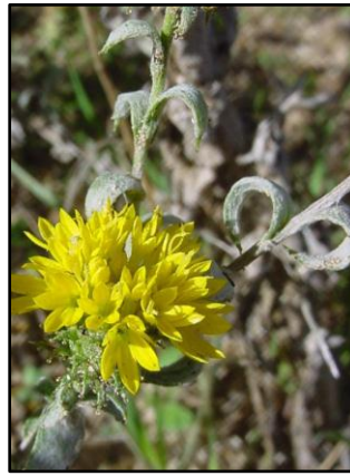
Warner Springs lessingia ( Lessingia glandulifera var. tomentosa ).