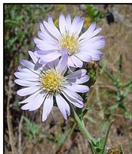
San Bernardino aster ( Symphotrichum defoliatum ).