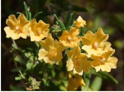
Bush monkeyflower ( Diplacus aurentiacus ).