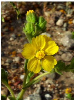
Mojave tarplant ( Deinandra mohavensis ).