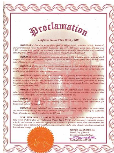
Proclamation from the City of Escondido.

contact with. And as the Panamint Daisy blooms and the Fremontia forms its buds, this is the perfect time to do it.