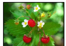
Wood strawberry ( Fragaria vesca )

Chapter field trips are free and generally open to the public. They are oriented to conservation, protection and enjoyment of California native plants and wildlife, and we adhere to all rules and guidelines for the lands on which we are visiting. In our arid region it is very important to be prepared for hiking on rugged and steep terrain and during wide temperature ranges and rapidly changing conditions. Participants should wear sturdy footwear and carry sufficient water, sun protection, food, clothing layers, personal first aid and other supplies you may need. If you have any questions about your ability to participate in a particular field trip, please contact Kay at fieldtrips@cnpsd.org .