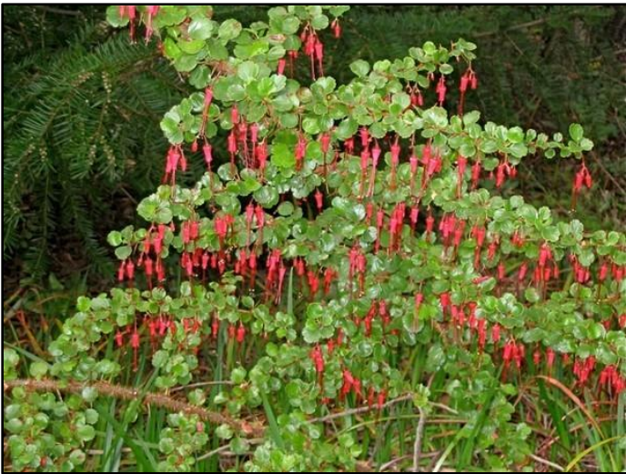
Fuchsia-flowered gooseberry ( Ribes speciosum).