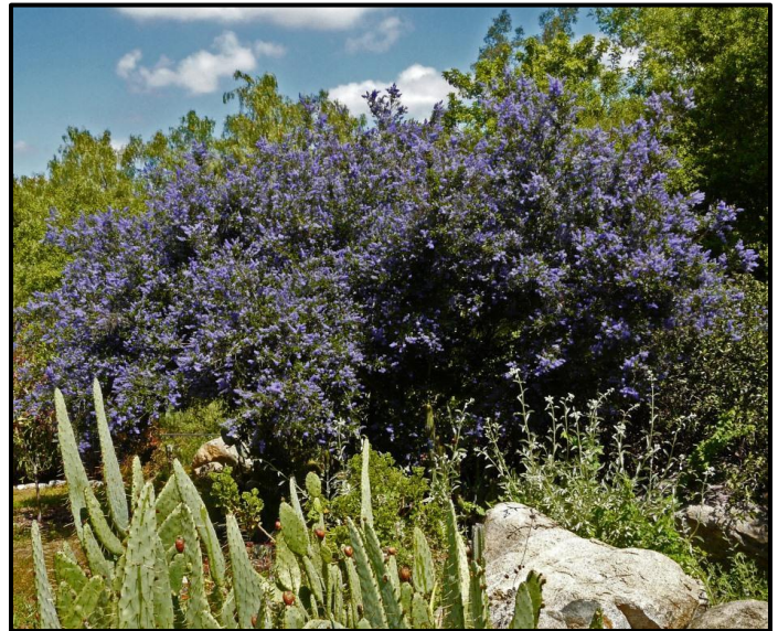
The Ceanothus in the County will be blooming soon. Here is the “pseudo-native” Ceanothus “Sierra Blue” in a garden setting, with non-native Opuntia sp. and native white sage ( Salvia apiana ) in front.