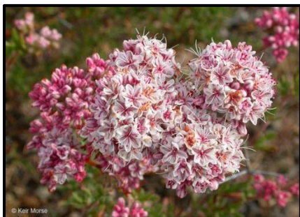
California Buckwheat ( Eriogonum fasciculatum var. foliolosum).

In September 2013 the Eriogonum Society had their fourth annual conference and meeting in Farmington, New Mexico. The 2014 annual conference will be June 20-22 in Twin Falls, Idaho.