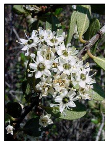
Wart-stemmed ceanothus ( Ceanothus verrucosus )