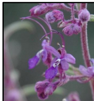
Woolly blue curls ( Trichostema lanatum )