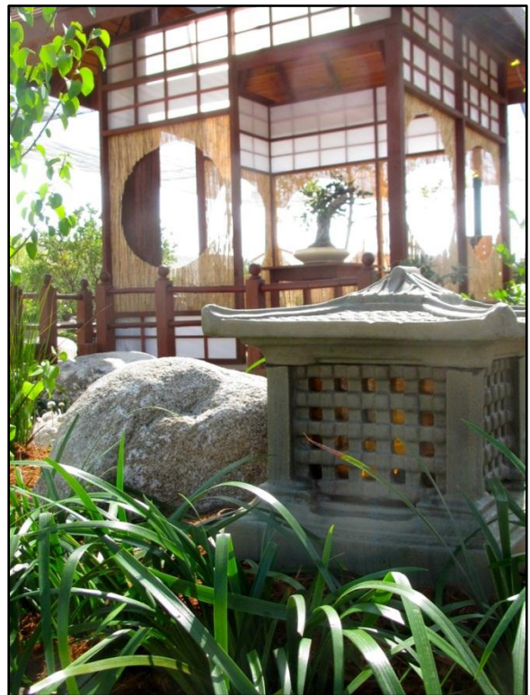
The Tea House with a bonsai lemonadeberry on the table and ceramic lantern in the foreground.

We determined rather quickly that a water feature would be too costly and hard to maintain. This became an opportunity to create an additional feature - a Zen garden, designed to mimic the appearance of water. Boulders would be used within this space to create islands, about which the gravel "water" would be rippled (with a homemade rake) to create the suggestion of movement. This is a uniquely Asian practice that would define the theme even better than if we had created a real pond.