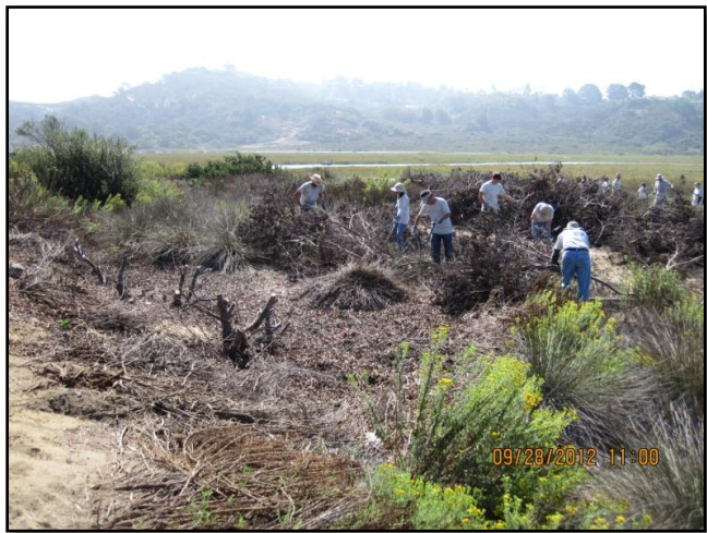
Vertex Pharmaceuticals volunteer team joins the Lagoon Platoon to remove golden wattle ( Acacia longifolia ) alongside salt marsh in the Reserve, exposing a stand of native southwestern spiny rush ( Juncus acutus ssp. leopoldiis ). Sept. 28, 2012.