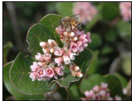
Lemonadeberry ( Rhus integrifolia ) at Torrey Pines State Park. Photo by Bobbie Stephenson.