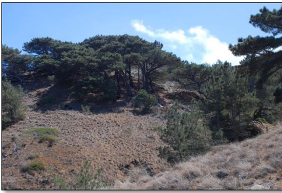
Torrey Pines on Santa Rosa Island

There is some question of whether or not Torrey pines ever grew on Point Loma. The habitat appears to be present, but early activities, including collecting wood for fire to cook whale blubber and dry cow hides, took place on the lower slopes of Point Loma at Ballast Point (Dana, 1840). These types of activities may have had an impact on any tree wood sources that were nearby, including pine trees that could have grown there. Unfortunately, documentation does not exist to indicate that pines occurred there.