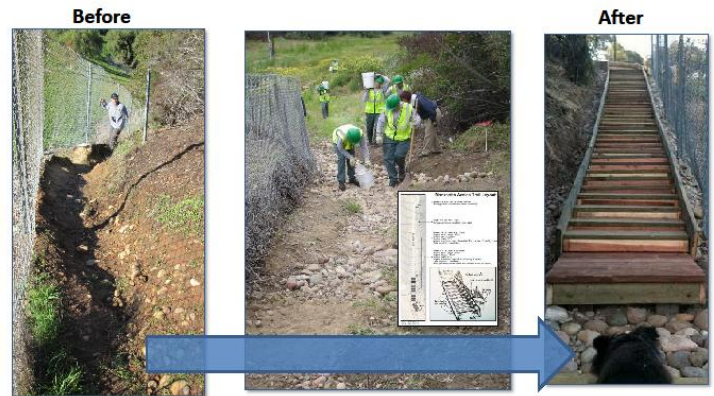
One of San Diego Canyonlands' Projects