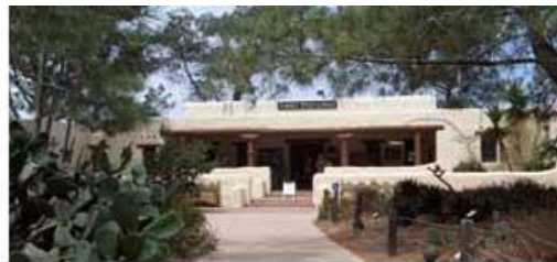
Torrey Pines Lodge is now the Torrey Pines State Park Visitor Center.