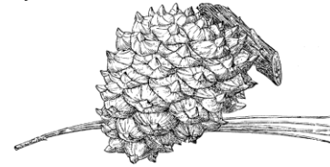
Torrey pine cone and needles