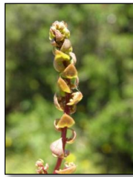
San Diego coastal creeper ( Aphanisma blitoides )

More than a few years ago Rod Dossey sent me a photo showing a brilliantly red plant, Aphanisma blitoides , that he found at Cabrillo National Monument. The species grows with more green early in the season but older stems can be a bright red (see photos). The bright red coloration of the foliage is easily noticed, so if you see such a thing, please report it me and I will pass the info along. (My contact information is on the back of the newsletter.) We still have remnant coastal bluff areas where there just might be some more San Diego coastal creeper growing.