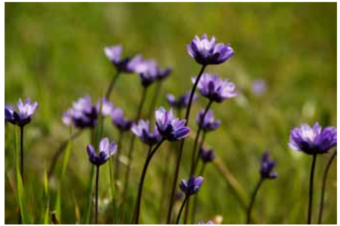
PERENNIAL from corm 1 - 2' high.