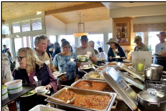
Chili bar (left) and guests enjoying the views during dinner (below).