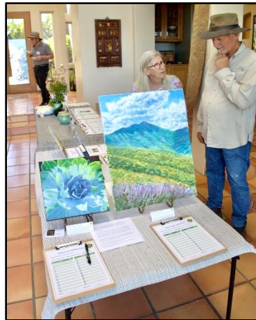
Left: Silent Auction.