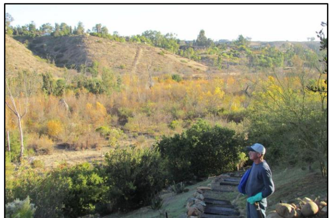
Bob Byrnes viewing native regrowth.

We are not done. There is one annoying hard-to-reach island that still needs to be dealt with, along with tiny patches that were passed over for one reason or another. But over ninety percent invasive removal with substantial native recruitment is quite an accomplishment!