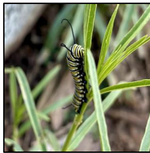
Left: Monarch caterpillar on Asclepias fasciculatum

The garden committee purchased all the irrigation lines and equipment for Bird Park, but the project is on hold until the City of San Diego gives us a start date for our next two "feather" plots. In the meantime, there is plenty of maintenance to be done.