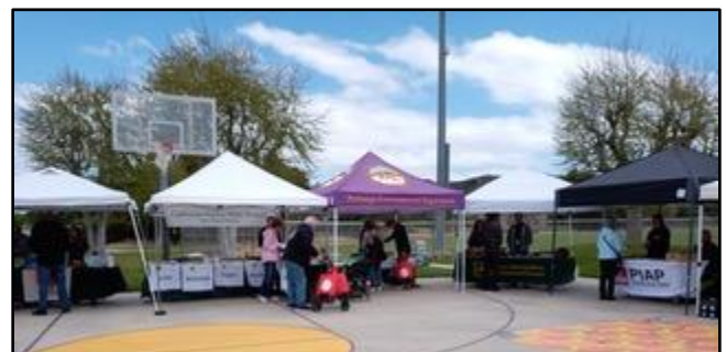
Above: CNPS San Diego booth at Pechanga Earth Day 2024.