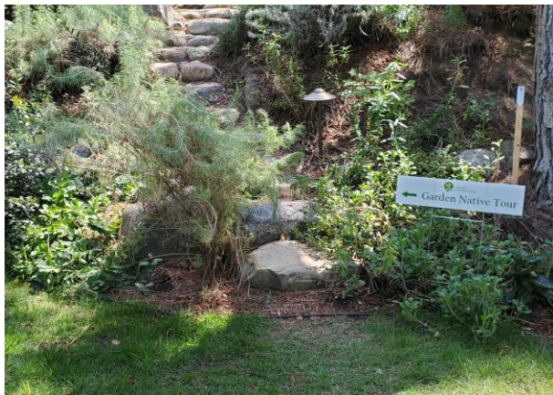
Another beautiful tour garden!