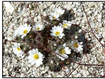
Acalypha californica (California copperleaf, left) was an interesting small shrub in the area. After passing between the canyon walls, the area dispersed upstream into broad sandy rivulets. Agave deserti (Desert century plant) appeared

on the stable sandy areas, with some in large clusters of more than a dozen of the sharp tipped rosettes of basal leaves. Psoralea schottii (Schott's indigobush), Ambrosia salsola (Cheesebush), Creosote bush, more chollas, and Chuparosa shrubs, and Simmondsia chinensis (Jojoba) were some of the dominants. Fouquieria splendens (Ocotillo), green with leaves on the stems at that time, were also present in this broad, open area. Salvia columbariae (Chia) grew in patches here and there. However, I was looking for a tiny plant. I squinted my eyes in the bright sun on the white-gray sand. I saw tiny plants, which from my height looked promising, but when I squatted down to get a closer look, they looked like an early phase of Stylocline , maybe S. micropoides , but it was too early to tell for sure.