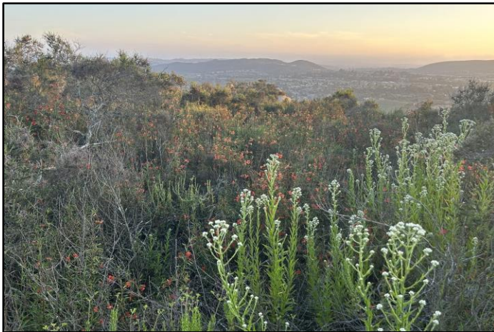
Boulder Mountain Preserve at sunset.