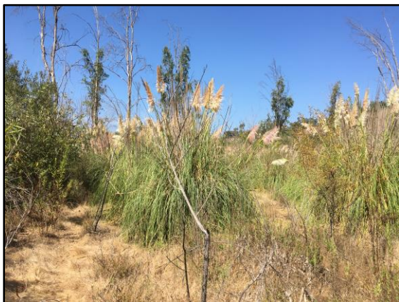
Pampas Grass that occupied large areas.

The project began with nearby homeowners being concerned about fire risk as the riverbed was dominated by highly flammable Arundo donax (Giant reed), Pampas Grass ( Cortaderia selloana ), and Eucalyptus , Acacia and palm species. Homes were lost when the area burned in 2007 and again in 2014. The weeds grew back quickly after each event, along with residential angst.