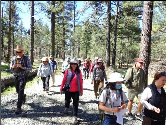
The group heads out into the Jeffrey pine ( Pinus jeffreyi ) forest near the Mt. Laguna campground - April 22 nd .

Check out the Chapter Field Trips coming up and the pics posted from past events at San Diego County Native Plant Society Meetup by registering for free. Reserve your space for field trips at https://www.meetup.com/San-Diego-County-Native-Plant-Discoverers-Meetup/ .