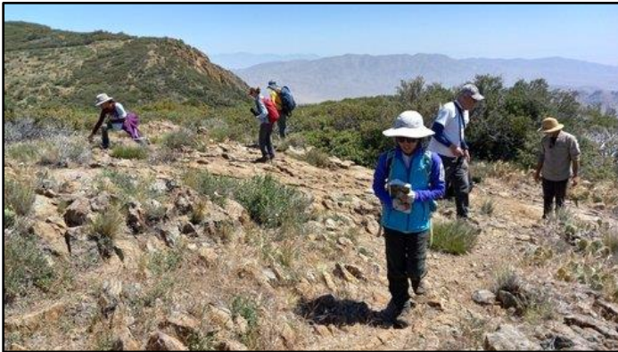
Looking for mariposa lilies at the Desert Overlook.