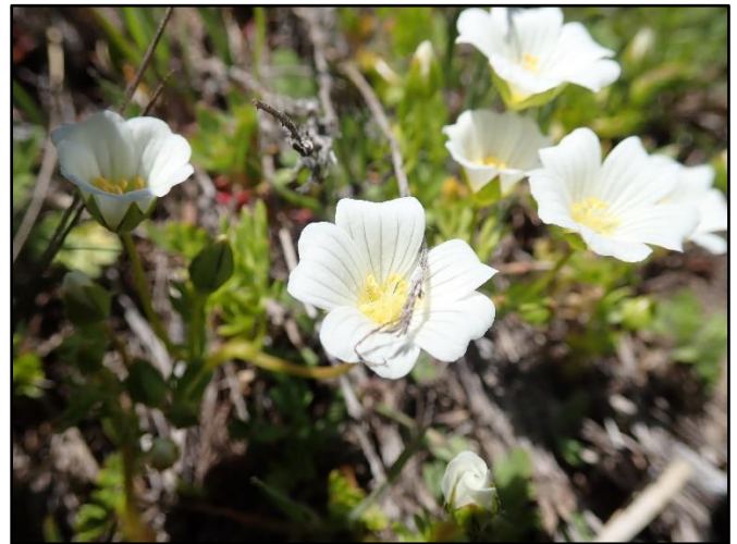
Parish's meadowfoam ( Limnanthes alba var. parishii ), cream cups, goldfields, and a native and non-native mix of dandelions edge on the Water of the Woods where Los Rasalies Lake feeds into Noble Canyon.