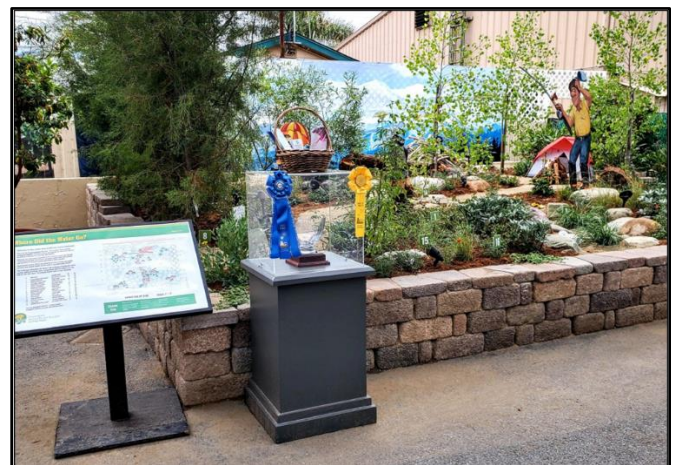
CNPS Garden Show Exhibit.

Our garden exhibit won 1st place for the fair's theme " Get Out There " as well as other awards for sustainability, best use of flowering plants and best landscape by a non-professional group. We were also awarded 4 ribbons for plants of distinction.