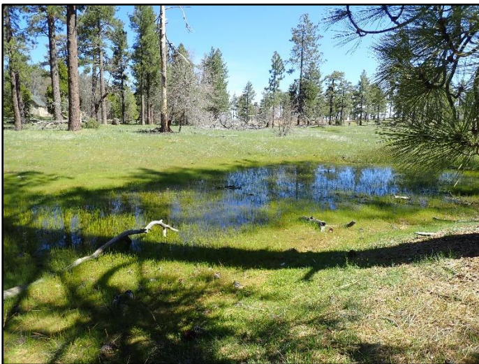
A seasonal pool filled with snow melt and rain water. Home to garter snakes, skinks, frogs, and salamanders, and an abundance of native sedges.