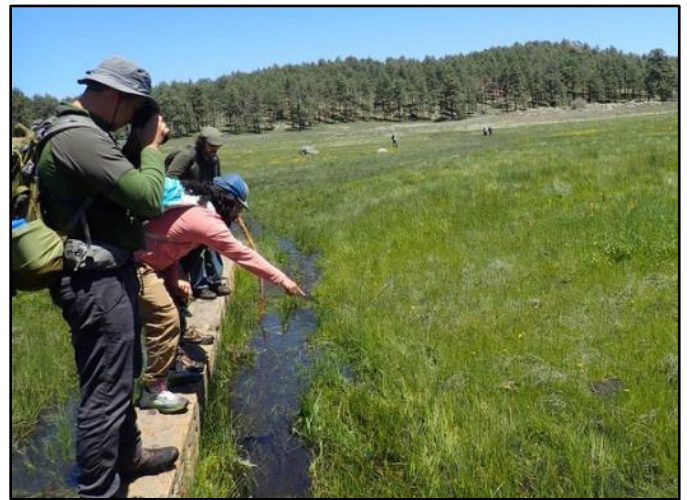
Pointing out the chirping Baja California chorus frog ( Pseudacris hypochondriaca ) happily chilling in its element.