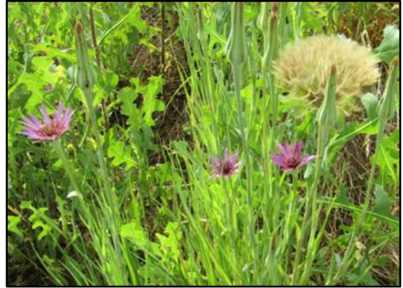
Purple salsify with prickly lettuce ( Lactuca serriola ).

salsify ( Tragopogon porrifolius ), an edible herb from Europe. It is not invasive but it is difficult to eradicate. They will try in coming weeks.