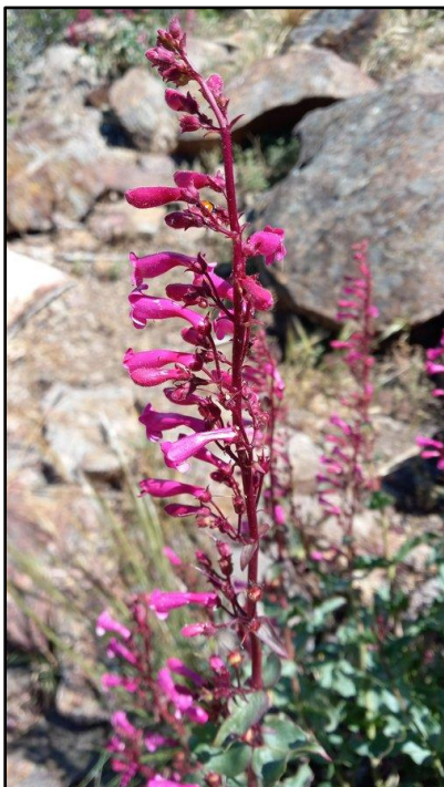
On the Garnet Peak trail, Cleveland's beardtongue ( Penstemon clelandii ) attracts hummingbirds and moths.