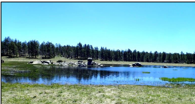
A full Little Laguna Lake, which many years is dry by May, was still full in May 2023.