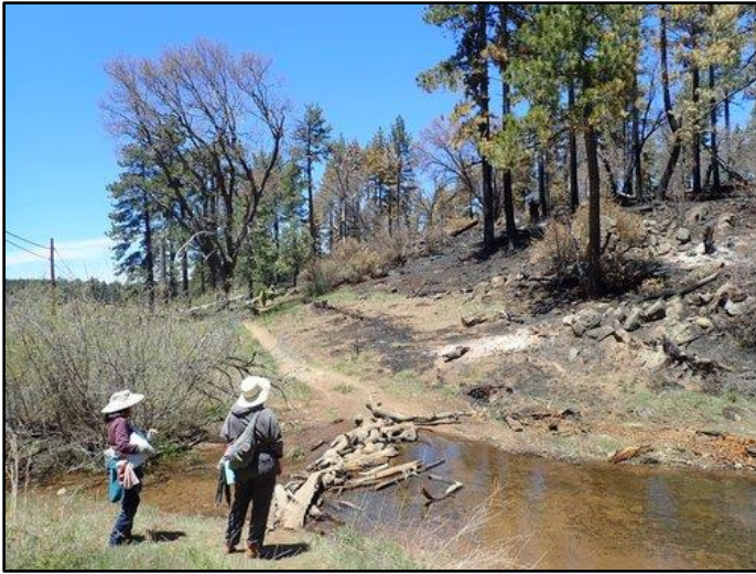
Checking out the recent prescribed burn area south of the Laguna campground.