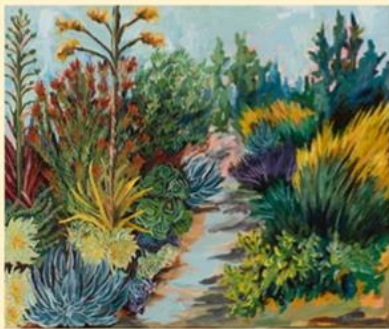
"Bringing Nature Back Home Pt. 1" by Molly Paulick

Seeking Artists for the CNPS San Diego 2020 Native Garden Tour April 4th & 5 th