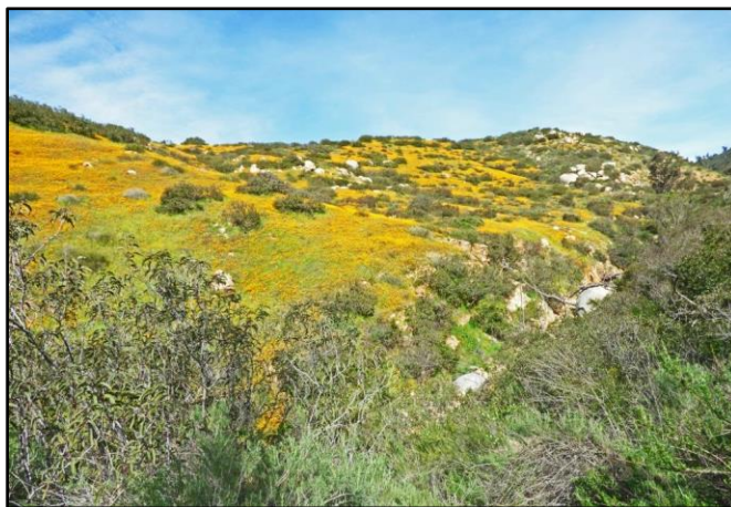
Remembering our colorful 2019 spring. Photo of Poway hills by Jürgen Schrenk.

SERCAL is a non-profit membership-based organization dedicated to advancing the science, art, and practice of restoring native California habitats.