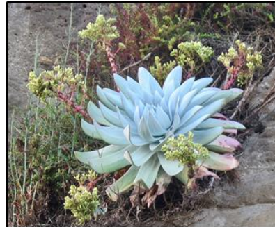
Giant chalk dudleya ( Dudleya brittonii ) photographed near Ensenada, Baja California.