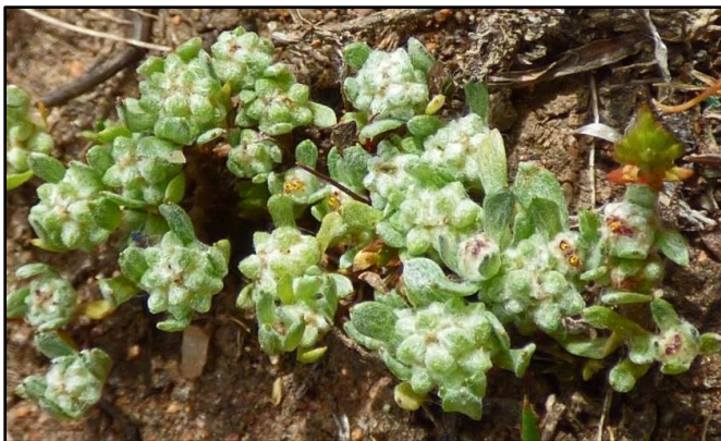
The Challenger School site had many woolly marbles ( Psilocarphus brevissimus ), a good vernal pool indicator.

The cool west wind blew across the broad mesa several miles west of the dark pine covered ridge of what is now Point Loma. The vegetation was a mix of Artemisia californica (California sagebrush), Eriogonum fasciculatum (California buckwheat) and Eriogonum giganteum (Island buckwheat) and Ceanothus (wild lilac) shrubs, and prairie habitat. The grass was dominated by Stipa species but was blended with a lot of wildflowers, including butter yellow Layia platyglossa (Tidy tips), purple Castilleja spp. (Owl's clover), blue and white Lupinus spp. (lupines) and the bright orange Eschscholzia californica (California poppy). The color of the flowers was brilliant under the hazy sun. A herd of North American Stilt-legged llama grazed in the midst of the color, bending their long necks to feed on the grasses. They were more slender than modern Llamas