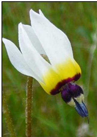
Shooting Stars ( Dodecatheon clevelandii ), one of our favorite spring flowers.