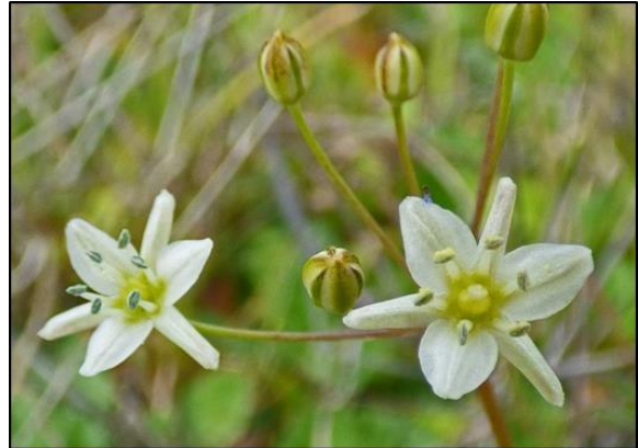
And finally, Muilla maritima (sea muilla) was just beginning to flower.