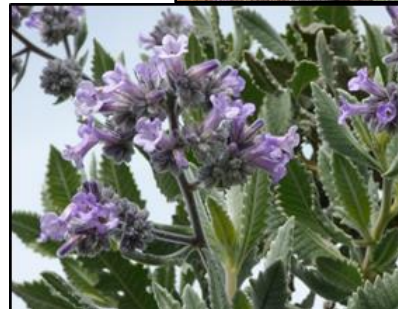
Felt leaved yerba santa ( Eriodictyon crassifolium ) was numerous and in full bloom - a very hairy affair.