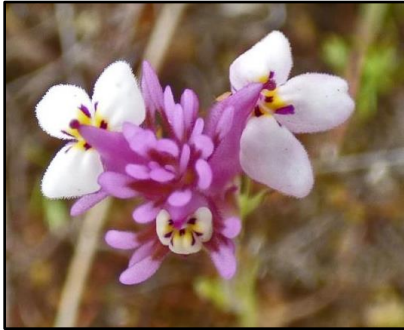
Less common were owl clover ( Castilleja densiflora ), here from the perspective of a flying pollinator.