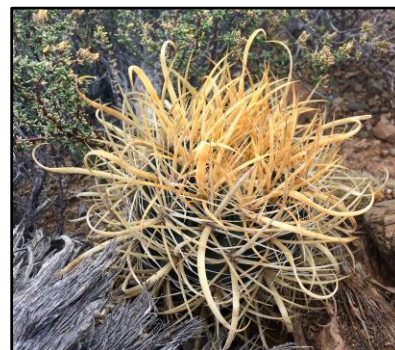
Golden spined barrel cactus ( Ferocactus chrysacanthus ), also a Cedros Island endemic.