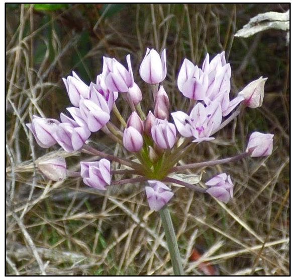
Allium praecox (early onion).